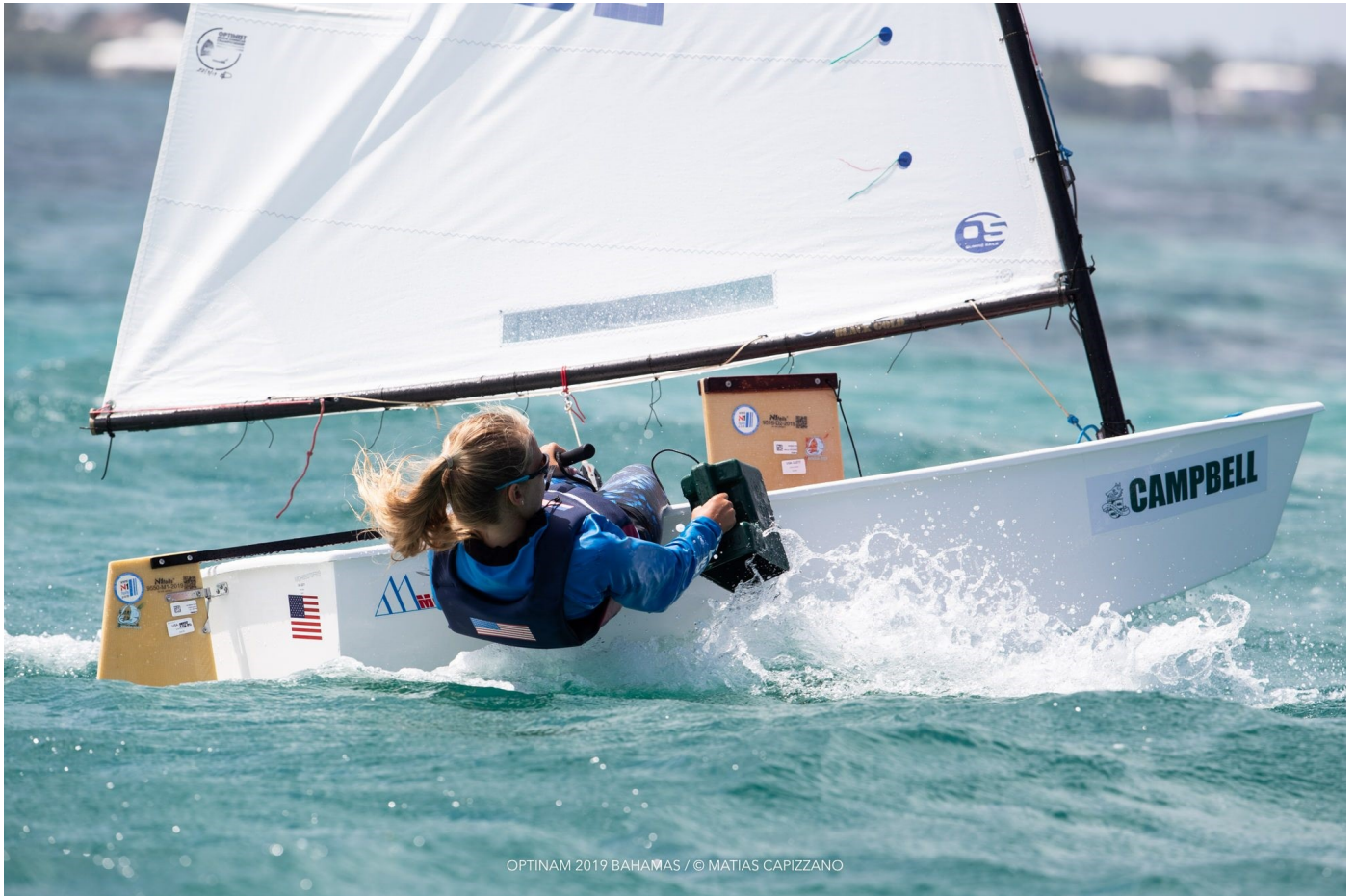
OPTINAM 2019 BAHAMAS / © MATIAS CAPIZZANO